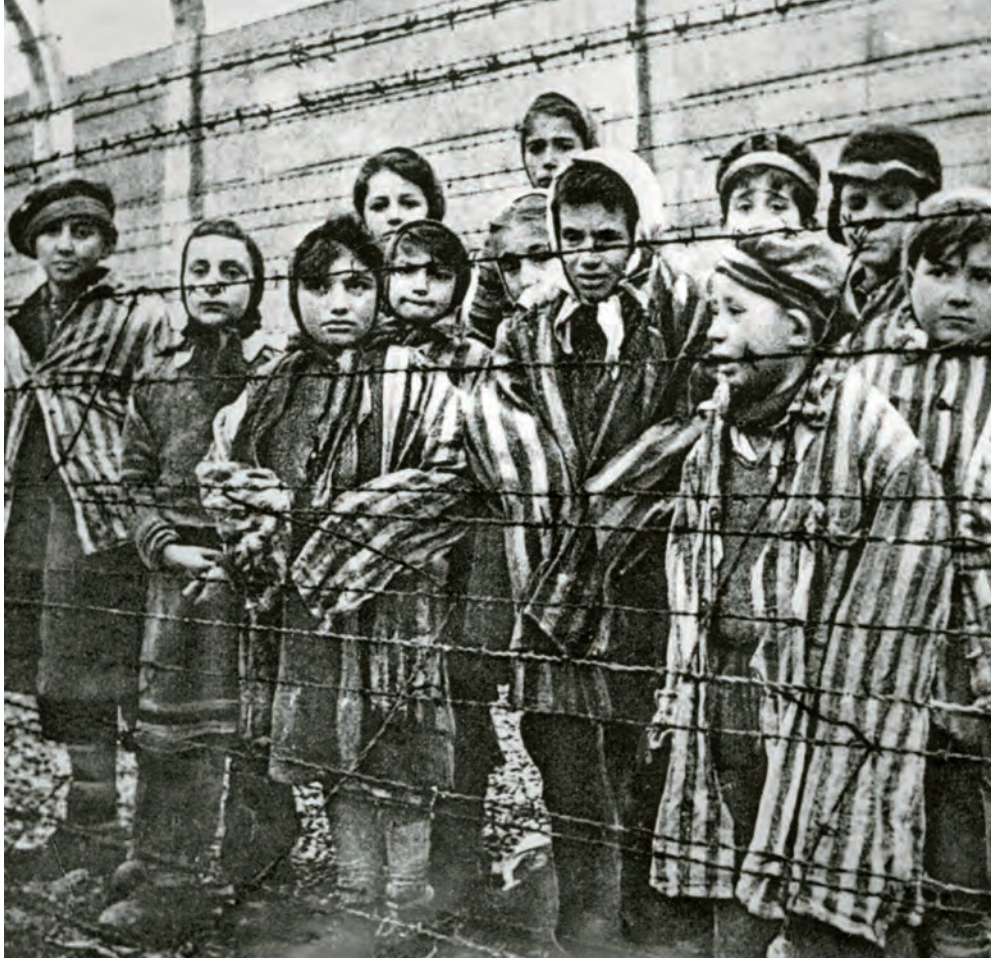
This 1945 photo shows children at Auschwitz, one of six death camps the Nazis built. Between 1933 and 1945, the Nazis murdered more than 6 million European Jews. Many were murdered in camps like this one. Catholics, Jehovah's Witnesses, Gypsies, gay people, and other groups the Nazis considered "inferior" were also murdered. This mass killing would later be called the Holocaust.