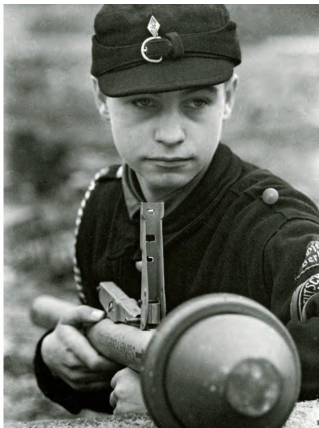
In the Hitler Youth, boys received military training and fought mock battles. They were being trained as future Nazi leaders.