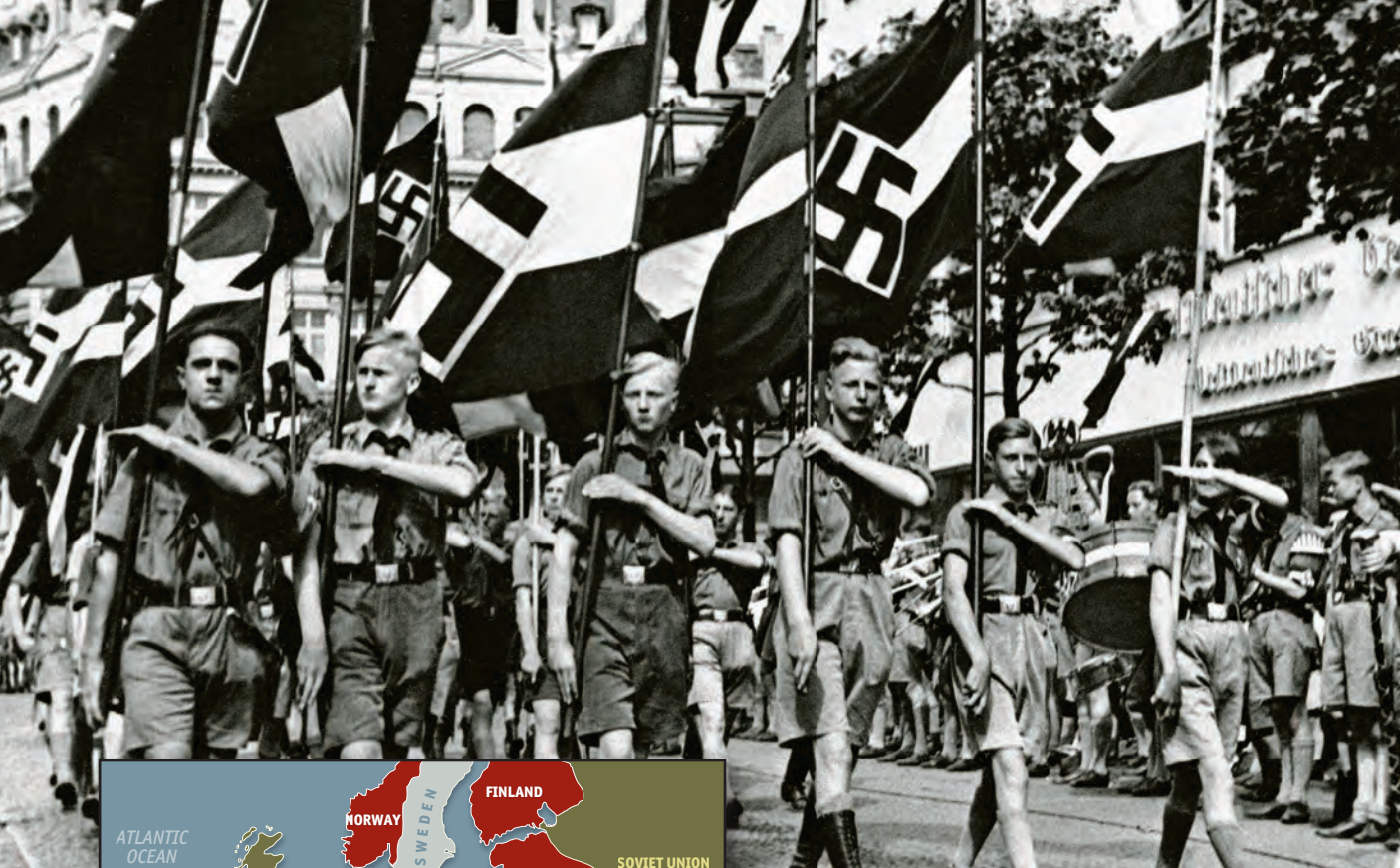
Above: The Hitler Youth march in a Nazi rally in Nuremberg, Germany, 1933. At the beginning of 1933, the Hitler Youth had 50,000 members. By 1936, membership had increased to 5.4 million. Left: This map shows Europe in 1942. What can you conclude about Nazi Germany?