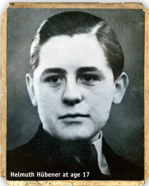
Helmuth Hübener at age 17

In the final days of World War II, Hitler committed suicide to avoid