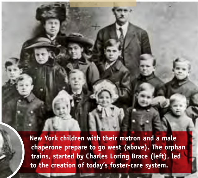
New York children with their matron and a male chaperone prepare to go west (above). The orphan trains, started by Charles Loring Brace (left), led to the creation of today's foster-care system.